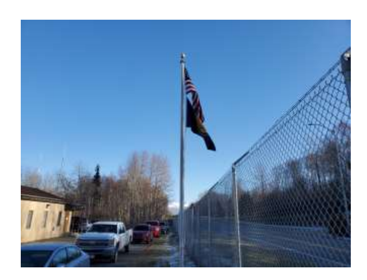
If you squint you can see the new RSOC logo flag

144.390 APRS (text message check-in). Listen for instructions from Net Control with regard to APRS callsign/SSID